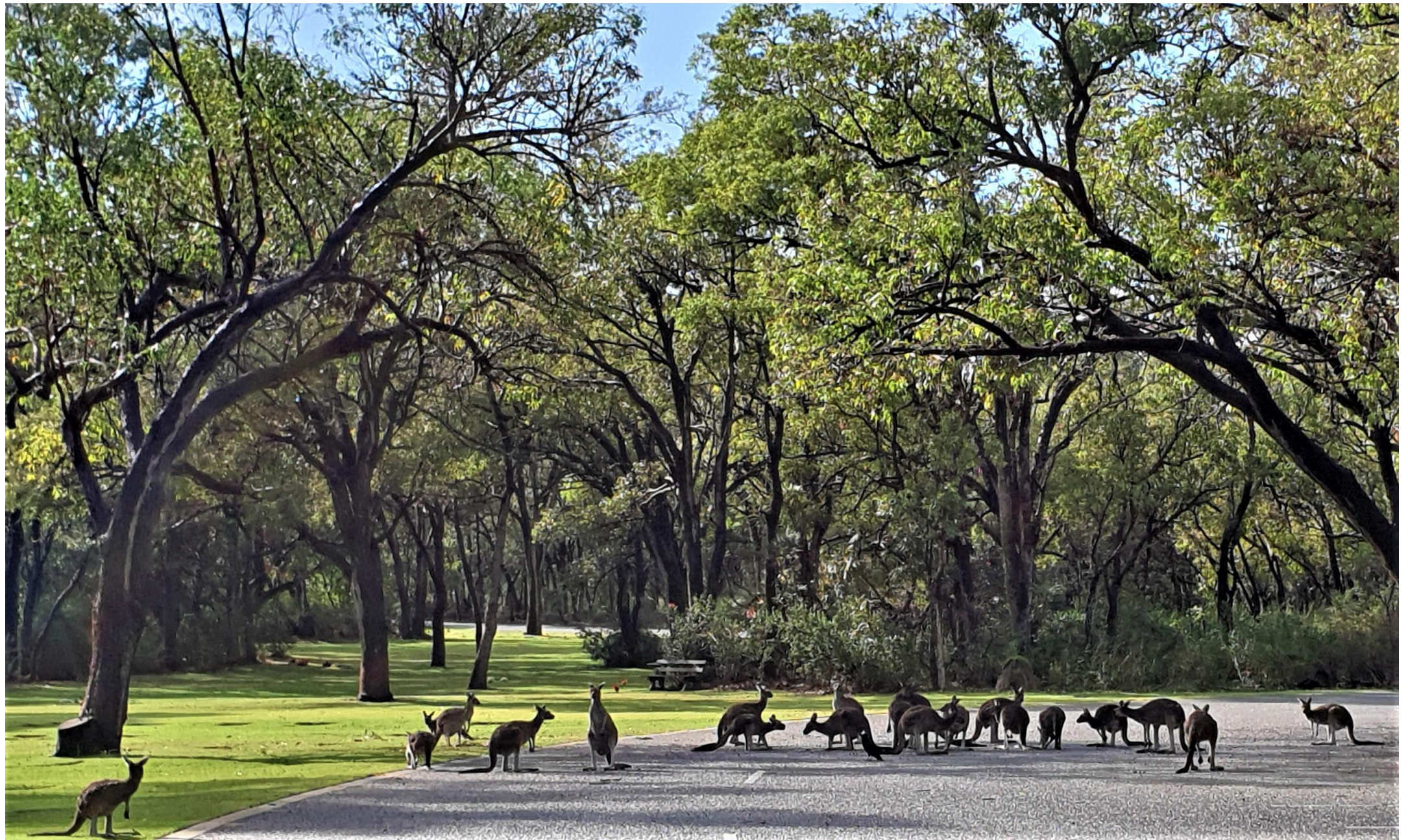
'Roo-d block, Pinnaroo Cemetery, Western Australia