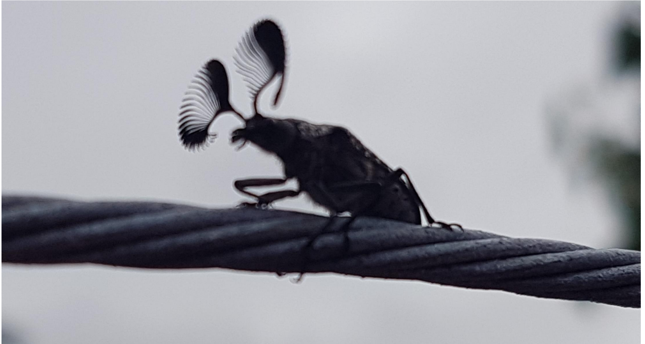
Enviably head gear, Perth