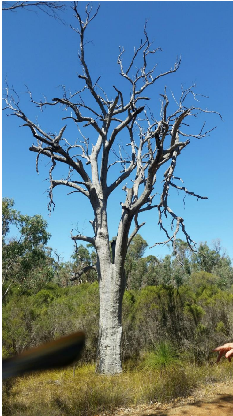
Bush walk, Lake Leschenaultia