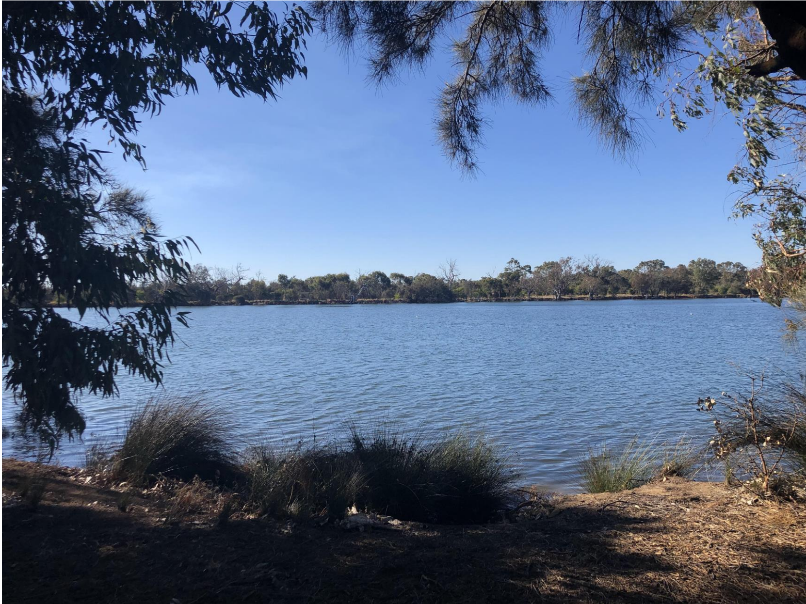
Restrictions easing, Collie River