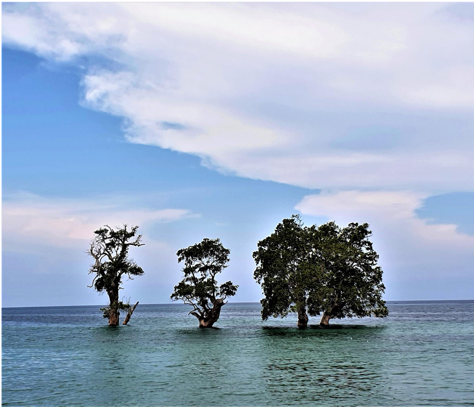
From Atauro island, Timor Leste