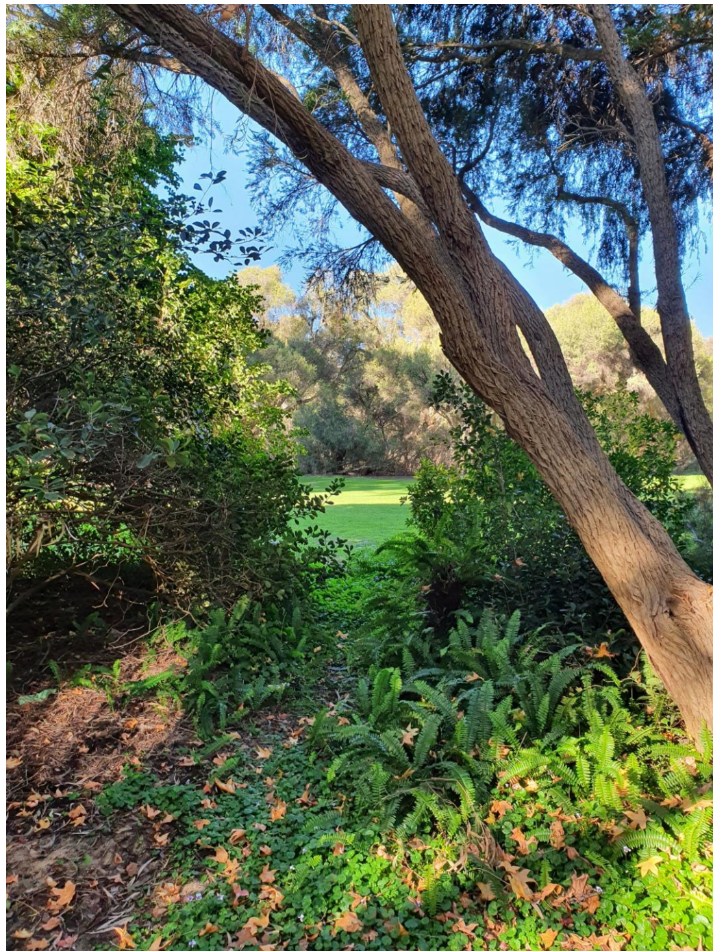
Autumn serenity, South Perth