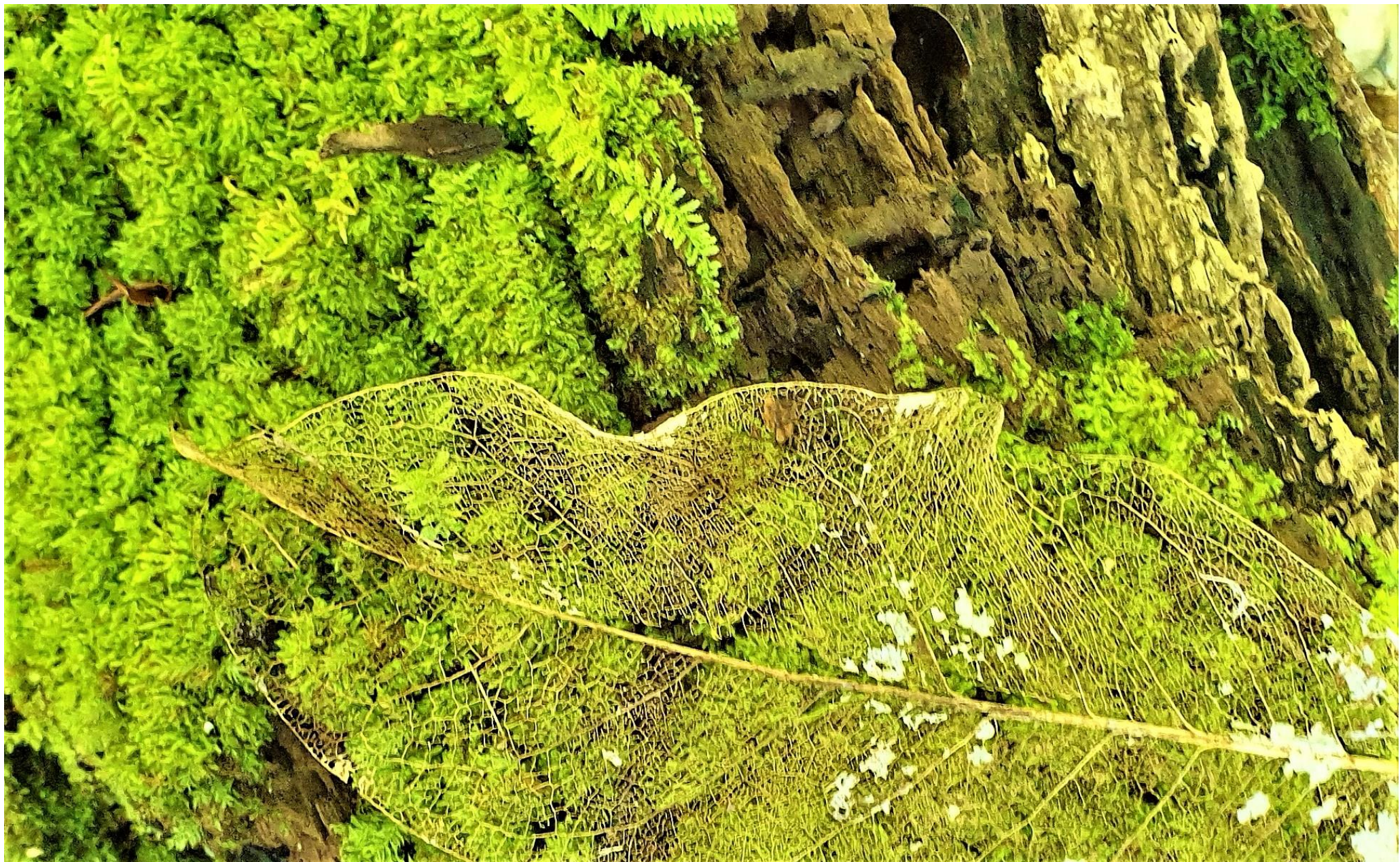
Nature's lace, Timor Leste