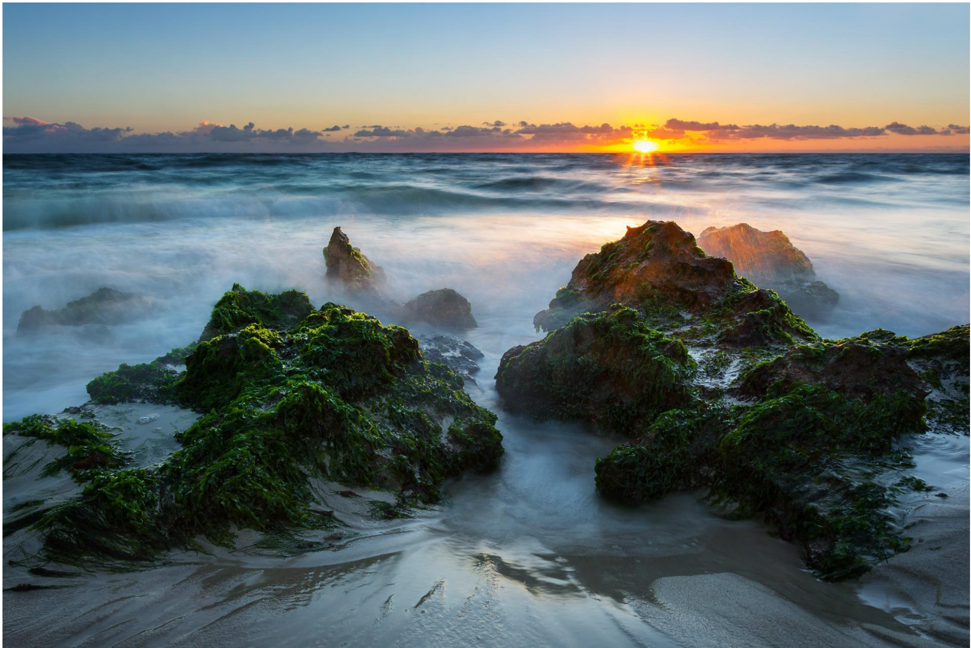
Marmion Beach, Western Australia