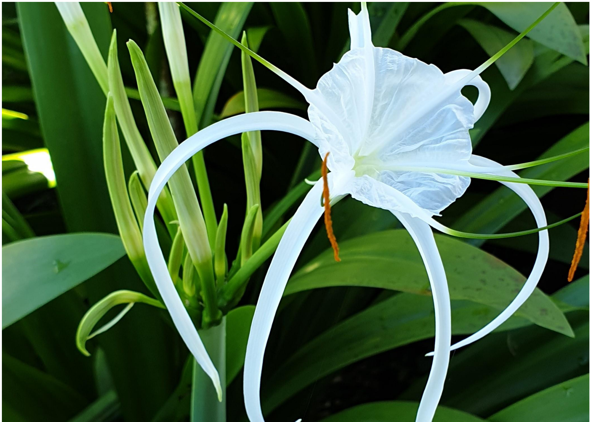
Spider lily, Timor Leste