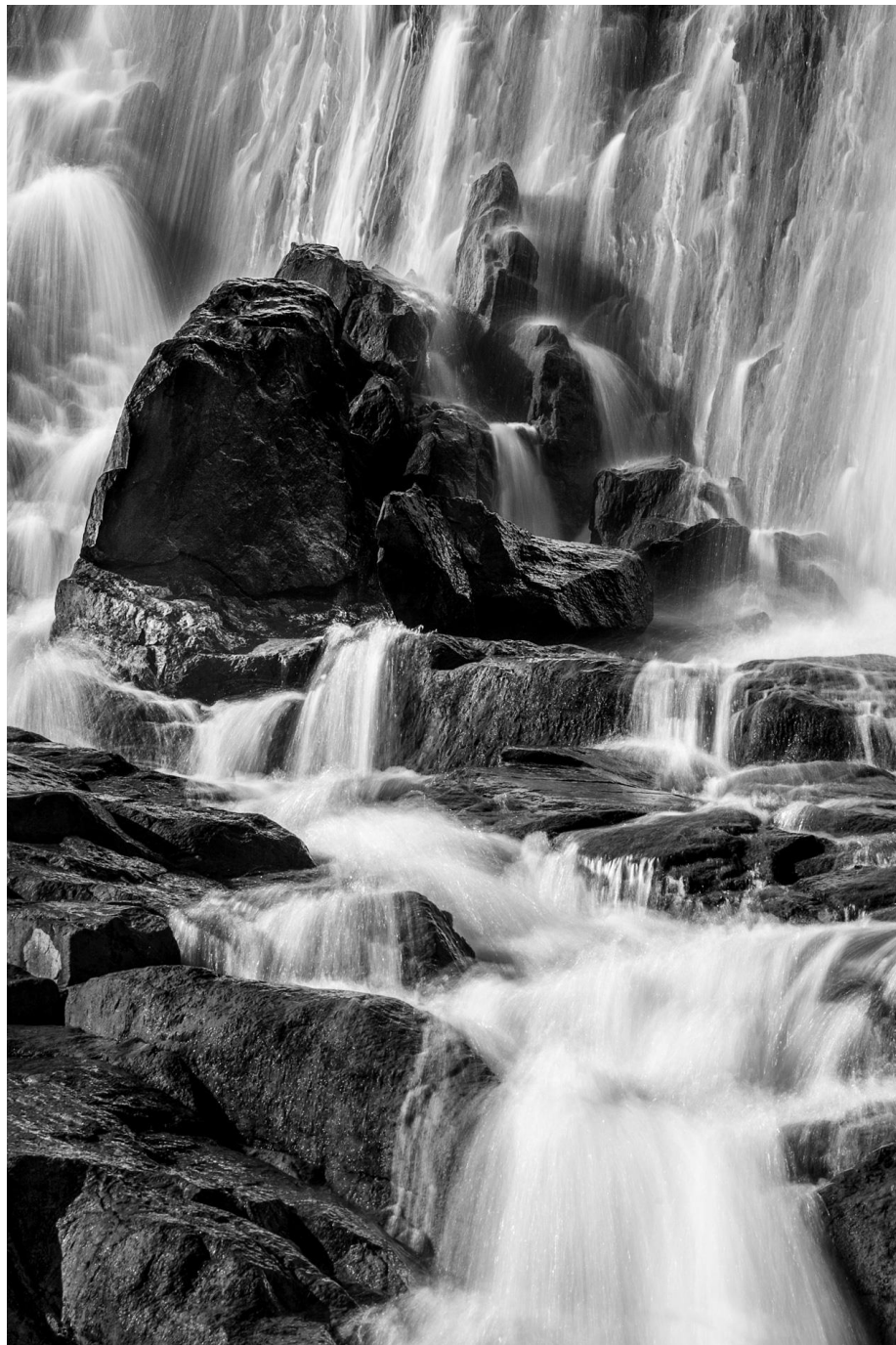
Lesmurdie Falls, Western Australia