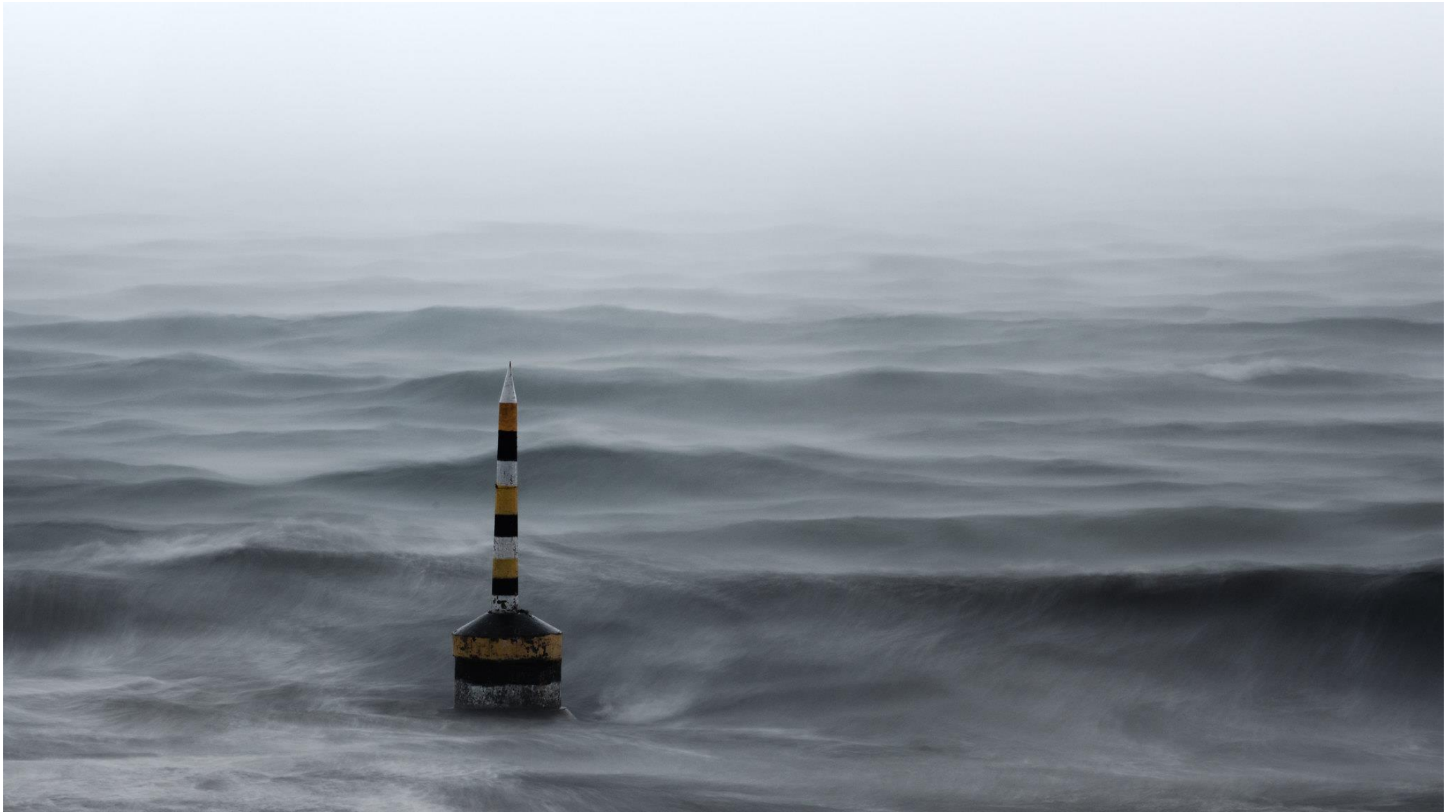
The day of the storm, Cottesloe Beach