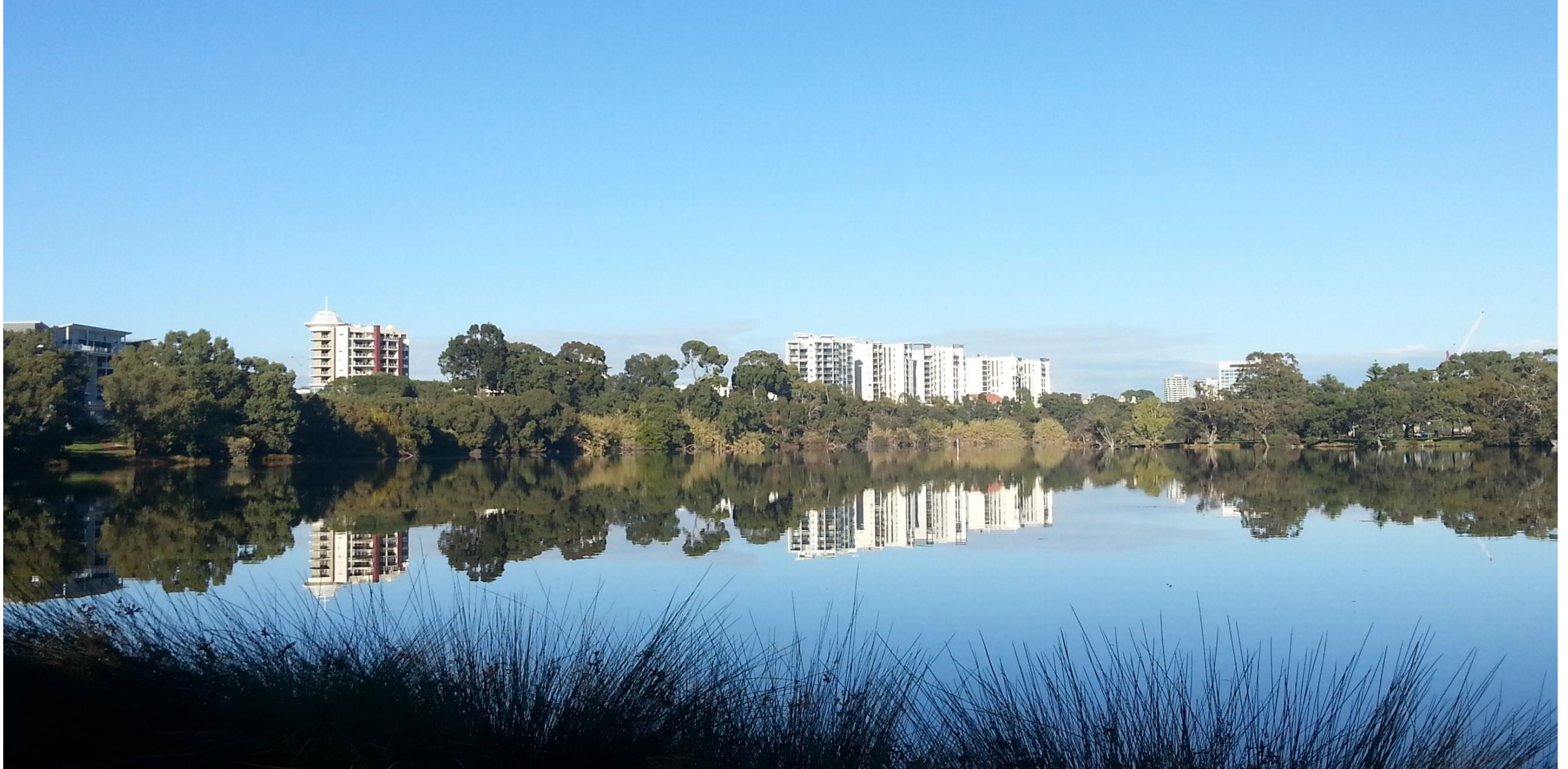
Swan River, early morning, Western Australia