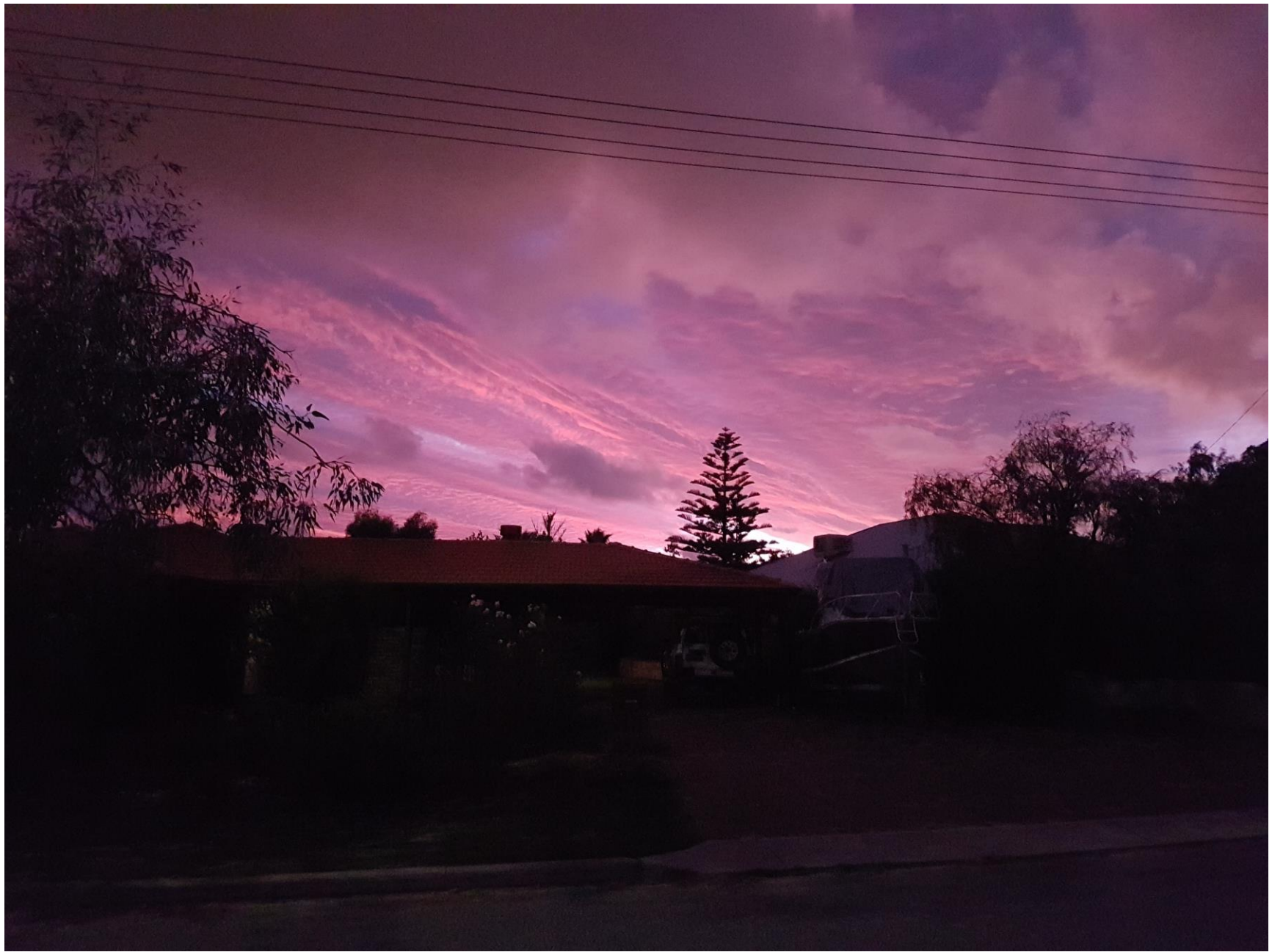
Sunset while walking, Perth