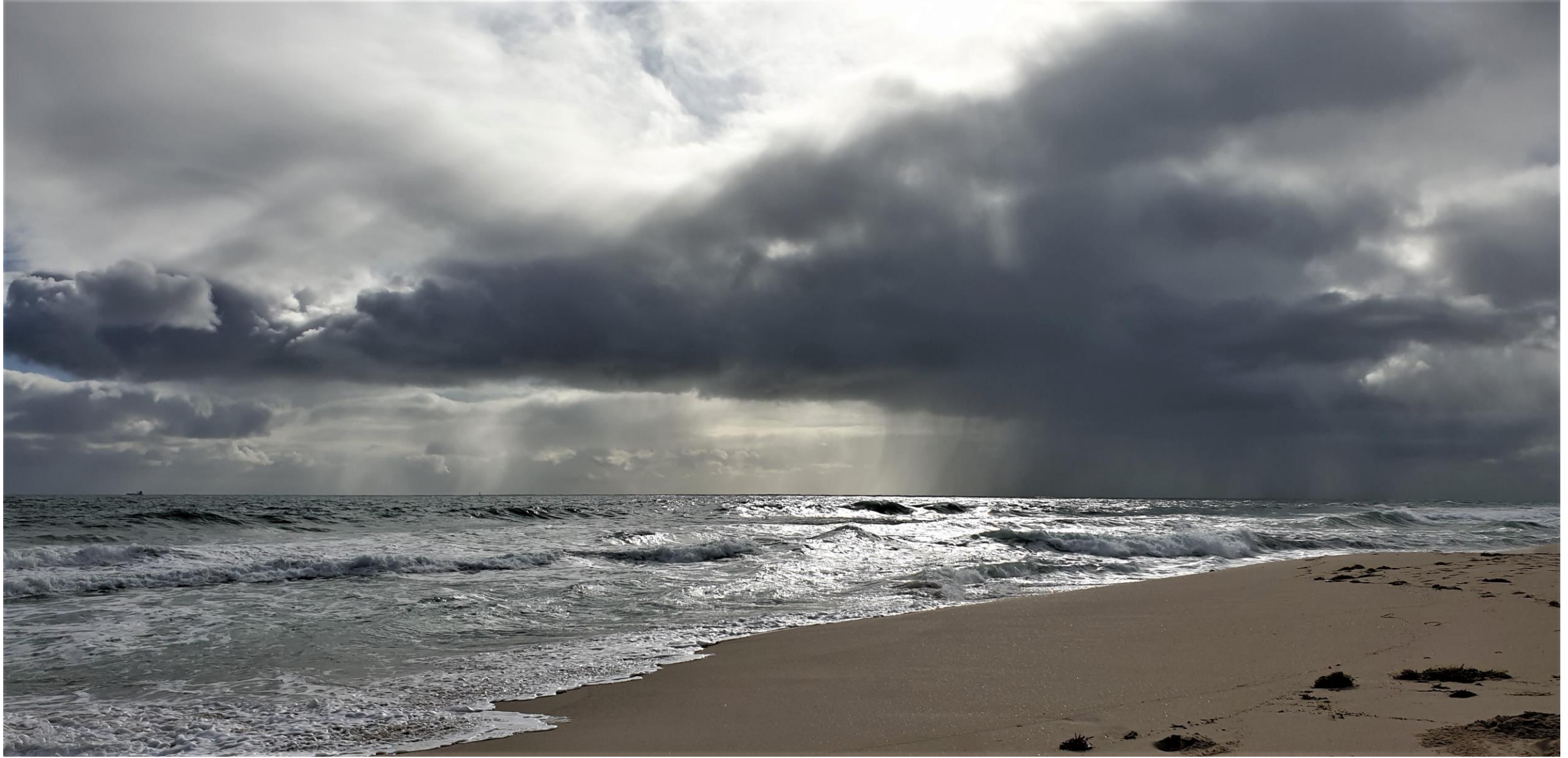
Winter imminent, Brighton Beach, Western Australia