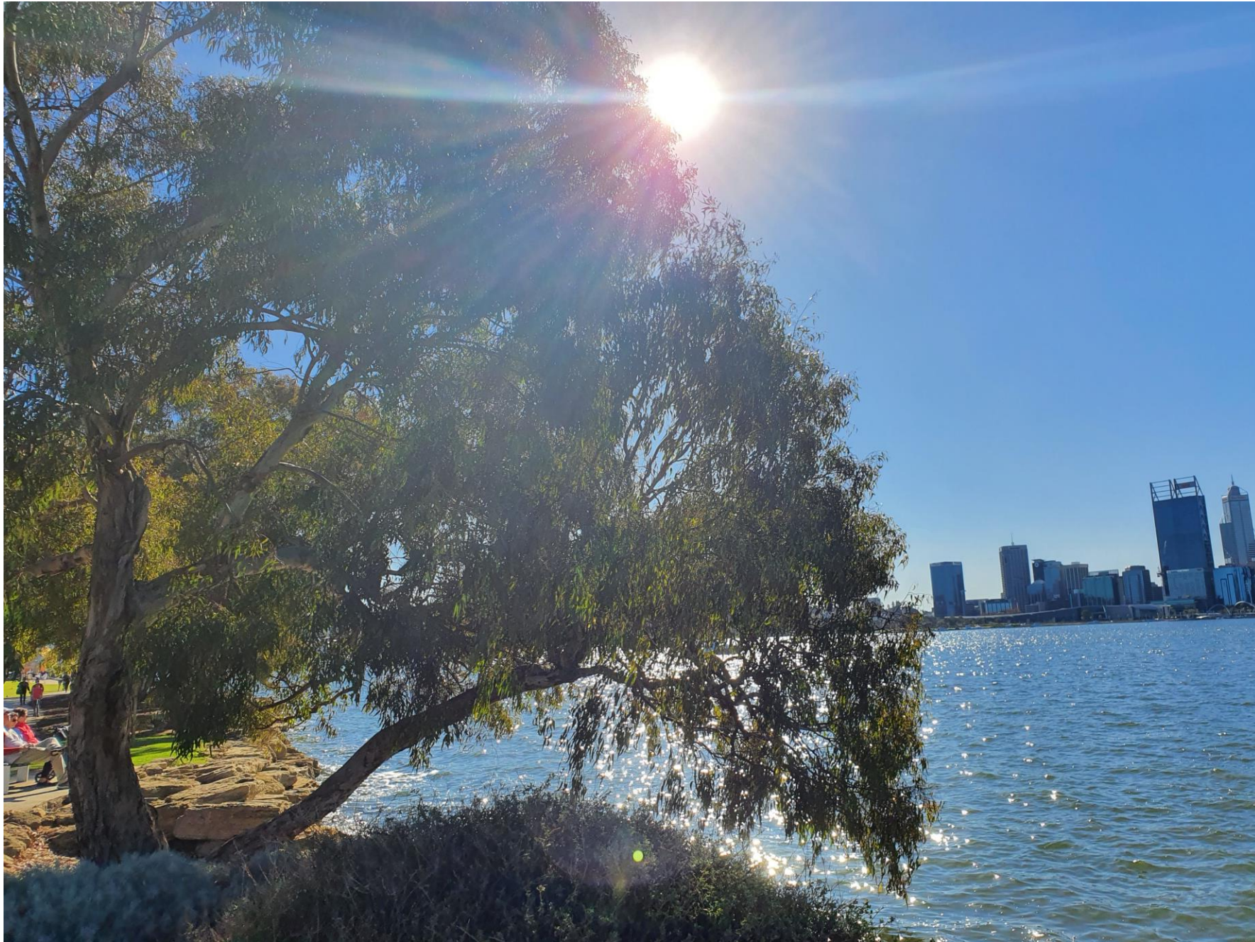
Autumn sunshine, South Perth