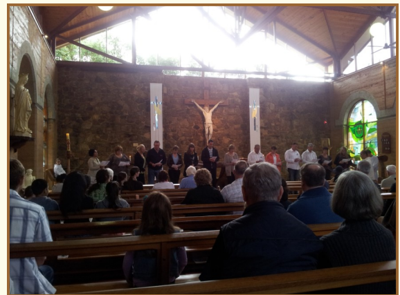
Co-Ordinators and Volunteers Commissioning Mass