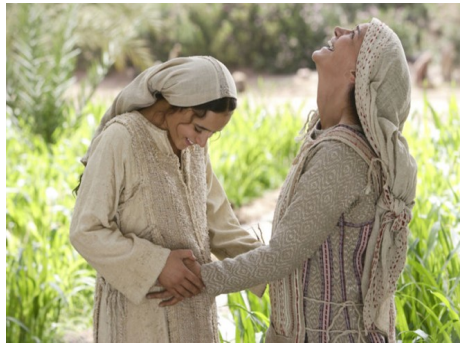
Nativity Story 2006 Movie